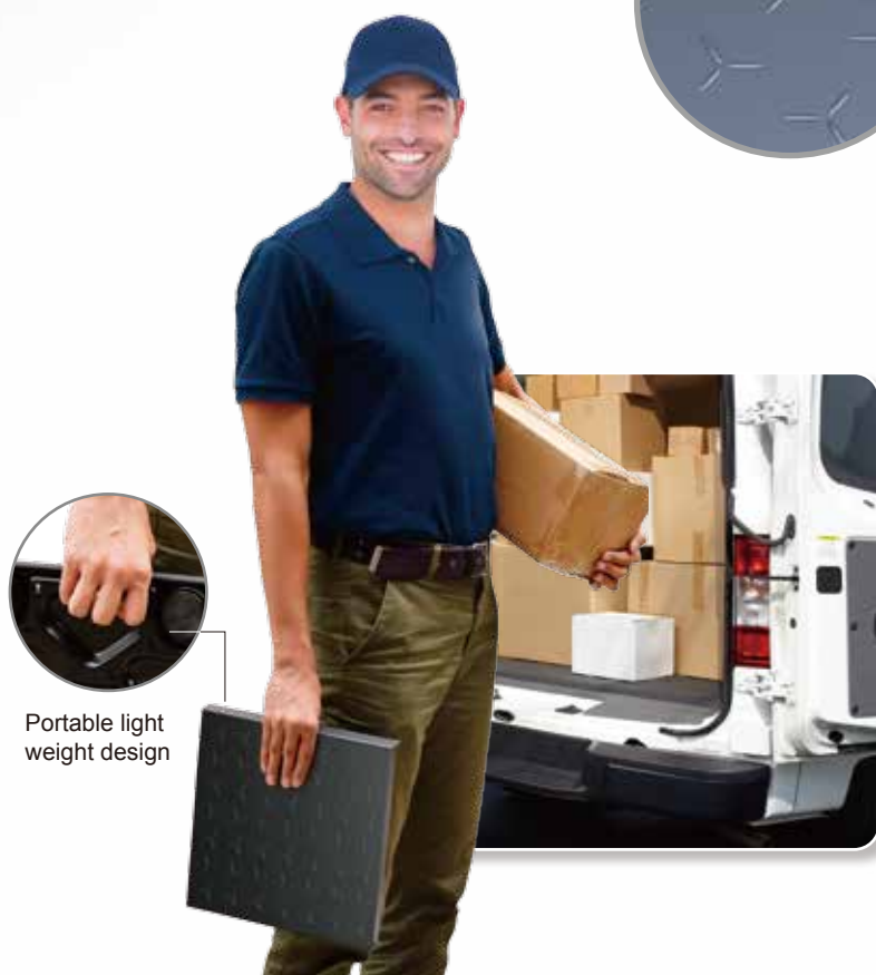
Portable light weight design