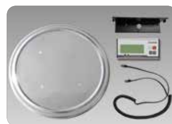
Parts: Platform, indicator, mount, cable