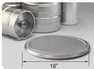
16" diameter, suitable for a variety of different keg sizes