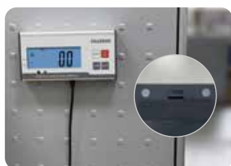
Indicator features magnets for wall-mounting