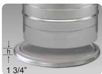
1 3/4" low-profile platform makes weighing heavy kegs easier and safer