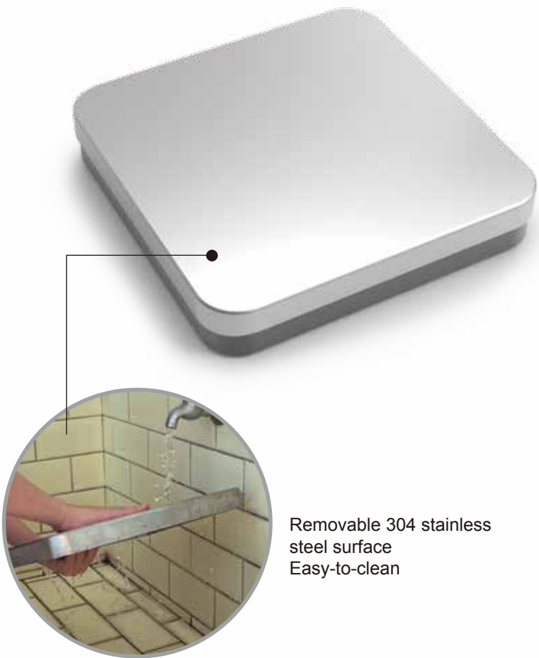
Removable 304 stainless steel surface Easy-to-clean