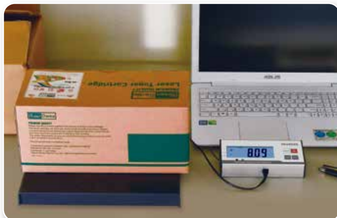
Transfer weight data to PC via USB for automated recordkeeping